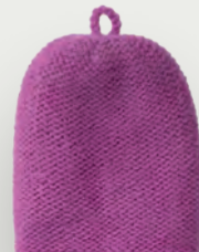
407 PURPLE WINE