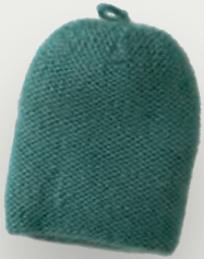
373 MALLARD GREEN