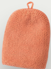
383 DUSTY ORANGE