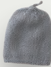
332 SILVER SCONE