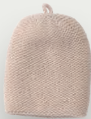
392 SILVER PEONY