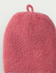
402 CALYPSO CORAL