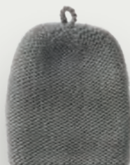
401 FOREST FOG