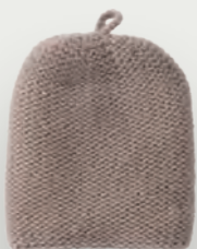
404 VEG LIGHT BROWN