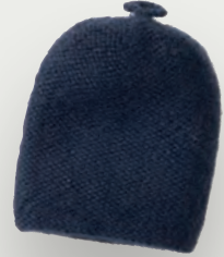
228 DARK NAVY