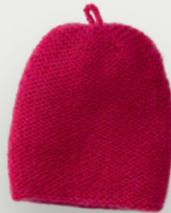
393 VIVA MAGENTA