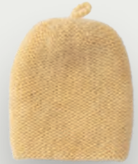
403 GOLDEN HAZE