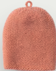
386 LIVING CORAL