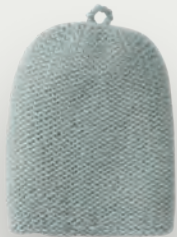
389 AQUA GREY