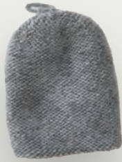
12 MEDIUM GREY MELANGE