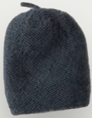
21 GREY FLANNEL