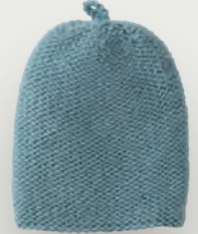
388 WEATHERED METAL