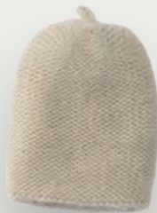
398 CANNOLLI CREAM