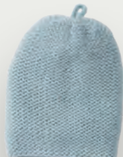
406 BLUE GLOW