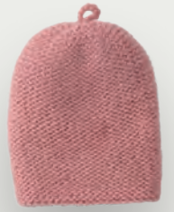
395 VEG. PINK