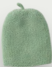
400 VEG LIGHT GREEN