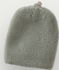
338 BURNED OLIVE