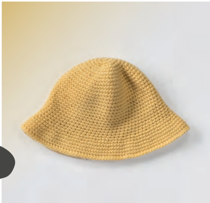
CHARLY KNITTED BUCKET