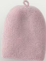
390 PALE LILAC