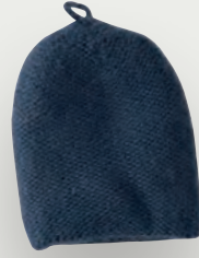
108 CLASSIC BLUE