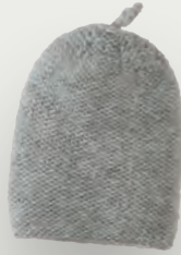
13 LIGHT GREY MELANGE