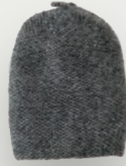
14 DARK GREY MELANGE