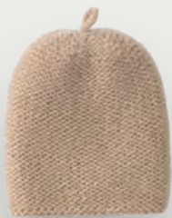
396 CHAMPAGEN BEIGE